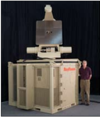
Stationary firing position with 360-degree coverage.