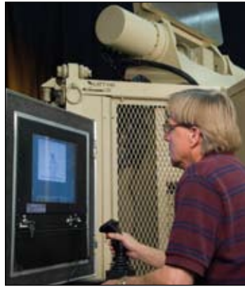
Easy-to-use joystick control with auto-tracking capabilities.