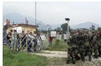
Military applications, including checkpoint security, perimeter and point defense, force protection and peacekeeping missions.

*The Joint Non-Lethal Weapons Directorate has stated that the long-range active denial systems (ADS) are effective beyond small-arms range, typically up to 500 meters. The Raytheon-funded mid-range Silent Guardian ADTS' range is greater than 250 meters.